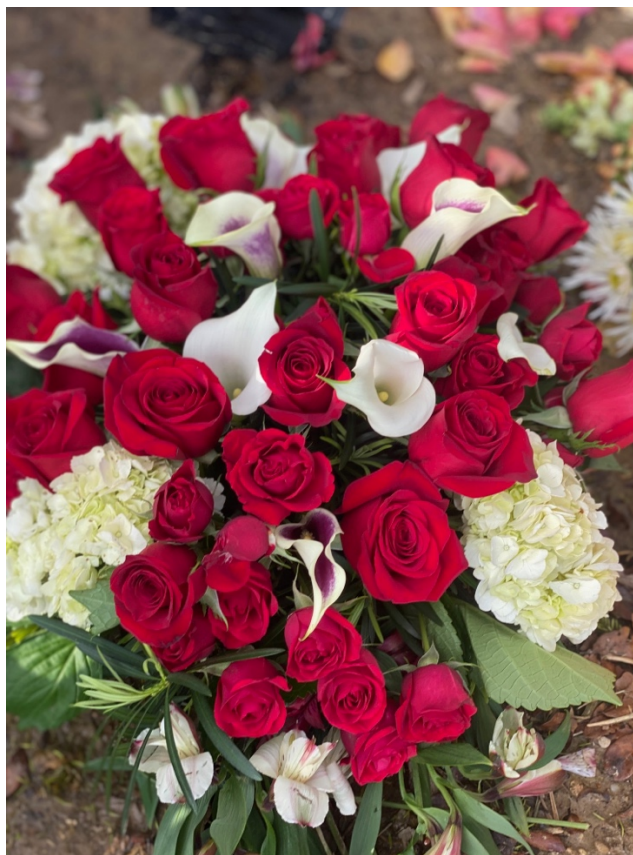
Ex. 1 at 6.

16. Angele designed complex, beautiful, and masterfully crafted floral arrangements. One such arrangement consisted of rich red roses and white calla lilies. The red roses were fully bloomed, showcasing their fine petals, while the incorporated calla lilies had a sleek, trumpet-like shape with a smooth gradient of white and soft pink. They were complemented by clusters of white hydrangeas, green leaves and white alstroemeria flowers interspersed throughout. The arrangement exuded elegance and dignity befitting their purpose.